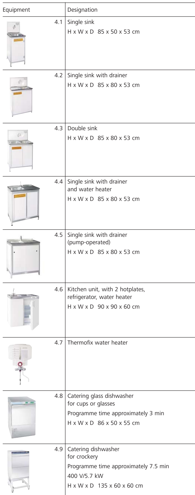
Illustration of hire equipment